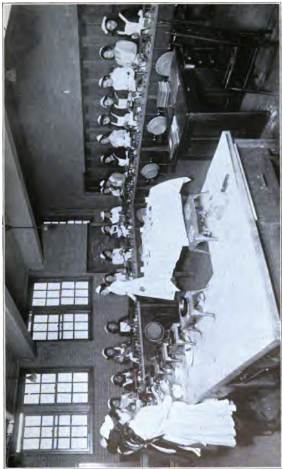
A cooking center in a basement